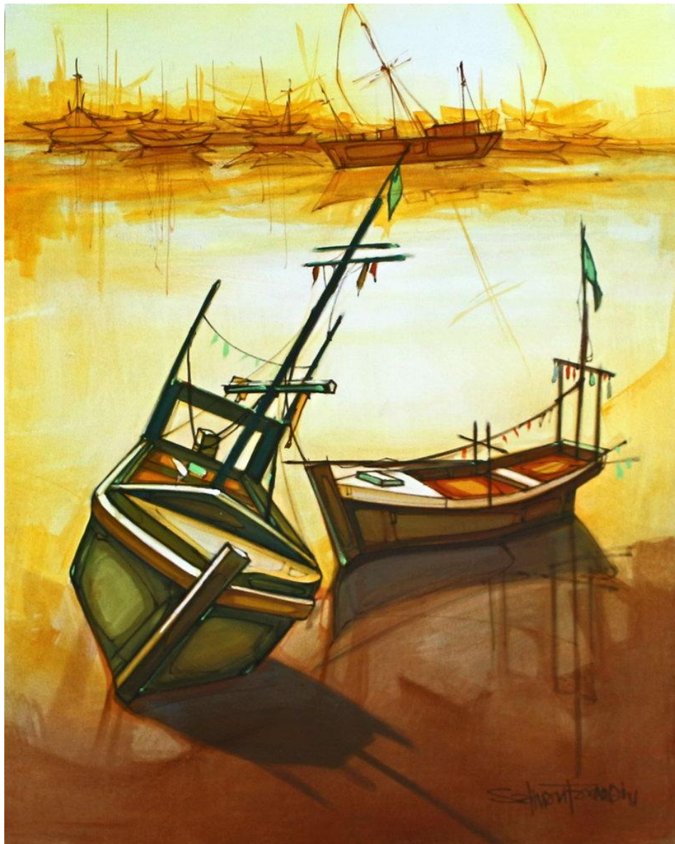
AC-SF-057, Acrylic on Canvas, 24 x 30 Inch, Rs. 65,000