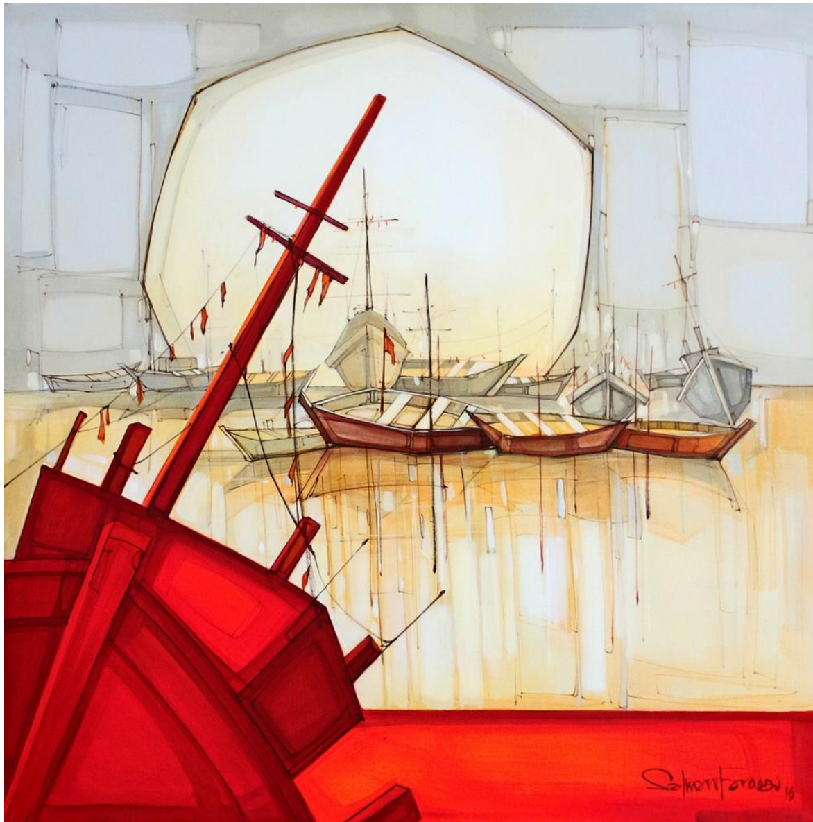
AC-SF-035, Acrylic on Canvas, 48 x 48 Inch, Rs. 165,000