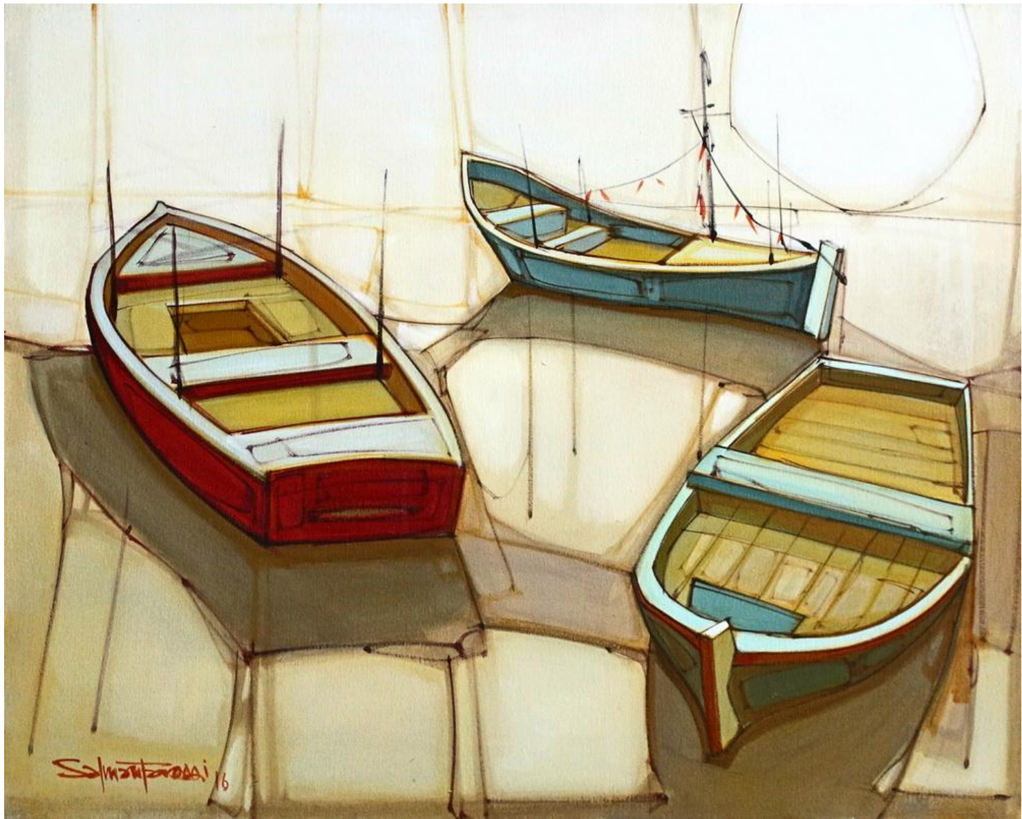
AC-SF-047, Acrylic on Canvas, 24 x 30 Inch, Rs. 65,000