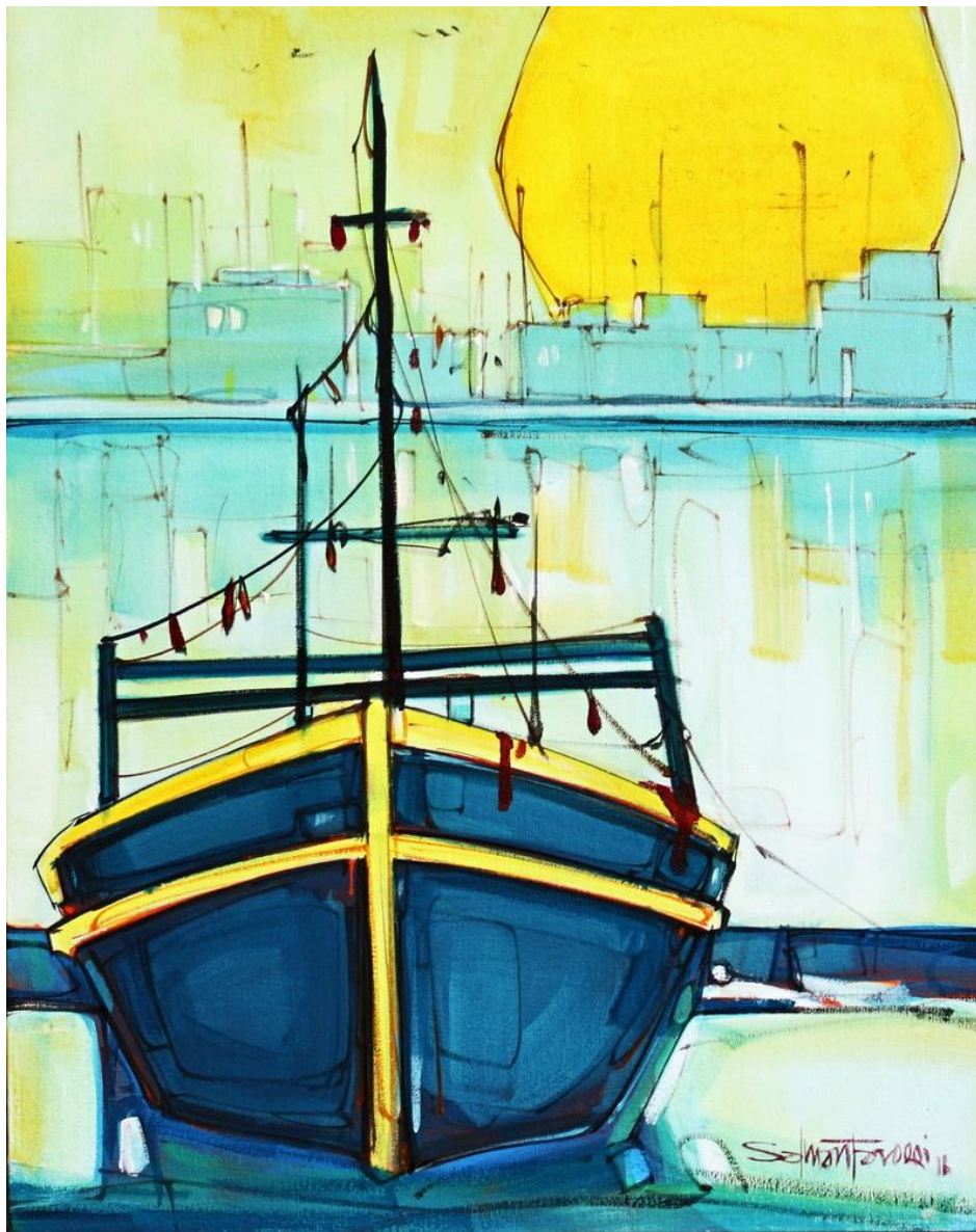
AC-SF-050, Acrylic on Canvas, 16 x 20 Inch, Rs. 50,000