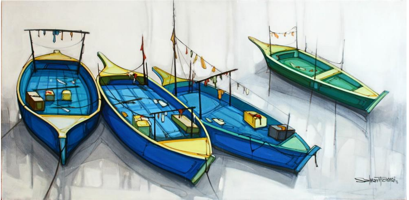
AC-SF-032, Acrylic on Canvas, 30 x 60 Inch, Rs. 175,000