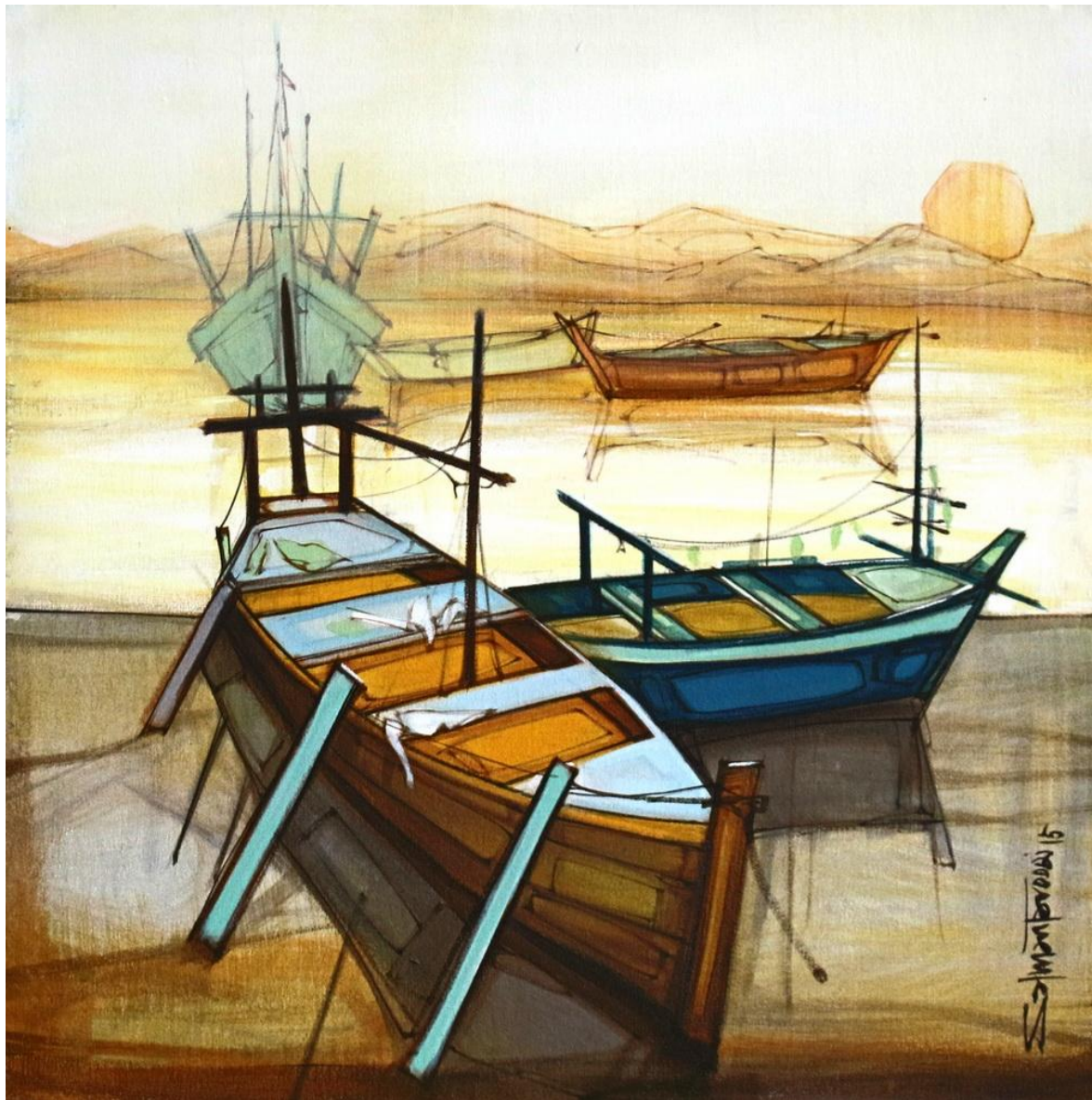
AC-SF-048, Acrylic on Canvas, 20 x 20 Inch, Rs. 55,000