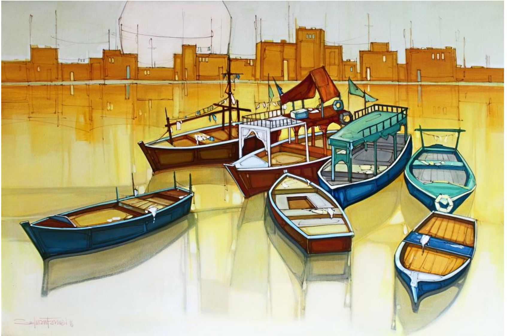
AC-SF-030, Acrylic on Canvas, 48 X 72 Inch, Rs. 225,000