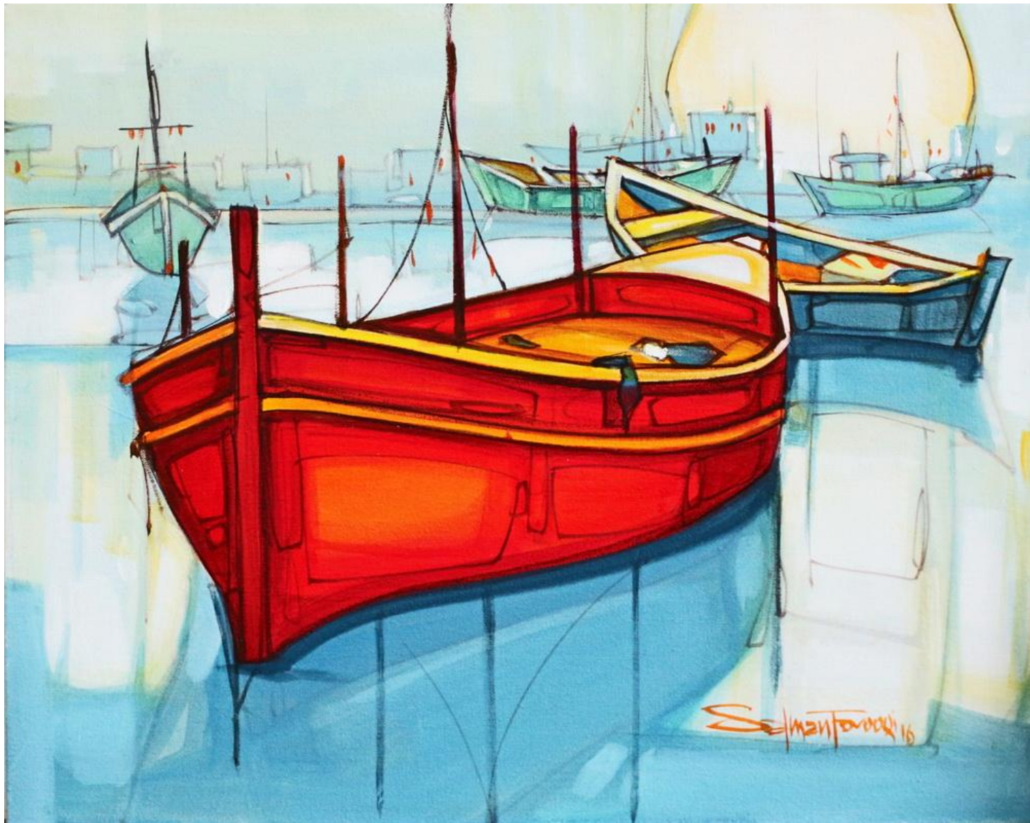
AC-SF-052, Acrylic on Canvas, 16 x 20 Inch, Rs. 50,000