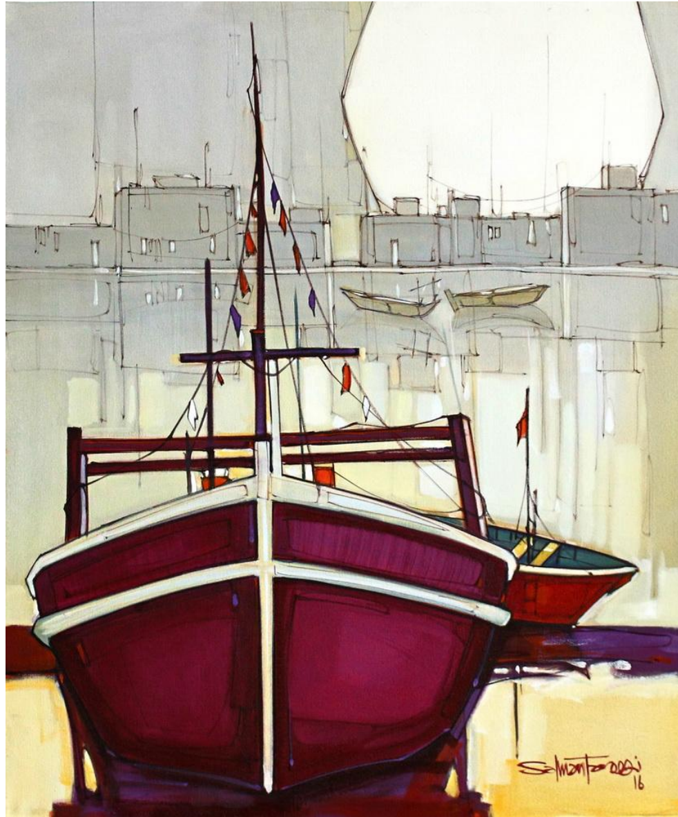
AC-SF-040, Acrylic on Canvas, 30 x 36 Inch, Rs. 80,000