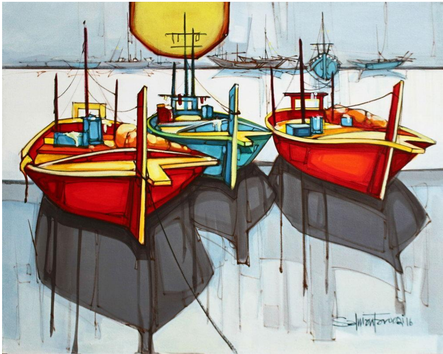
AC-SF-056, Acrylic on Canvas, 24 x 30 Inch, Rs. 65,000