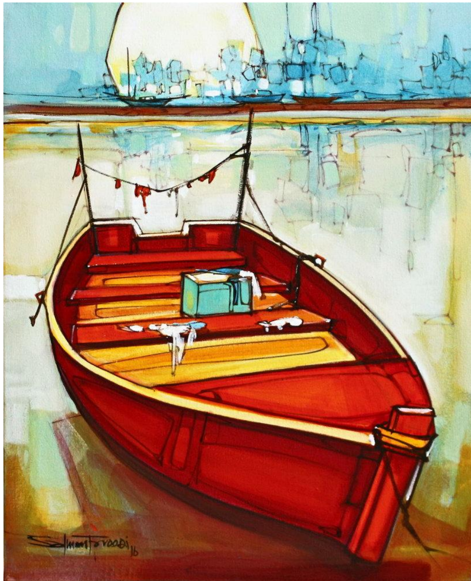
AC-SF-055, Acrylic on Canvas, 16 x 20 Inch, Rs. 50,000