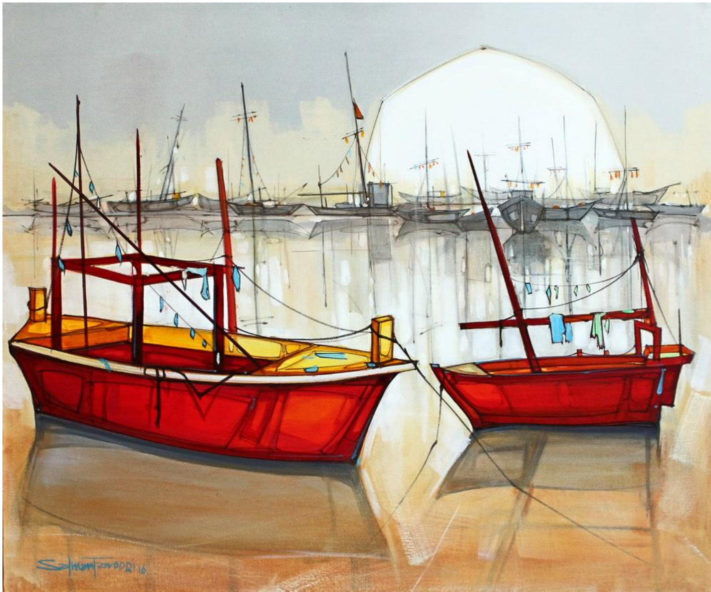
AC-SF-042, Acrylic on Canvas, 30 x 36 Inch, Rs. 80,000