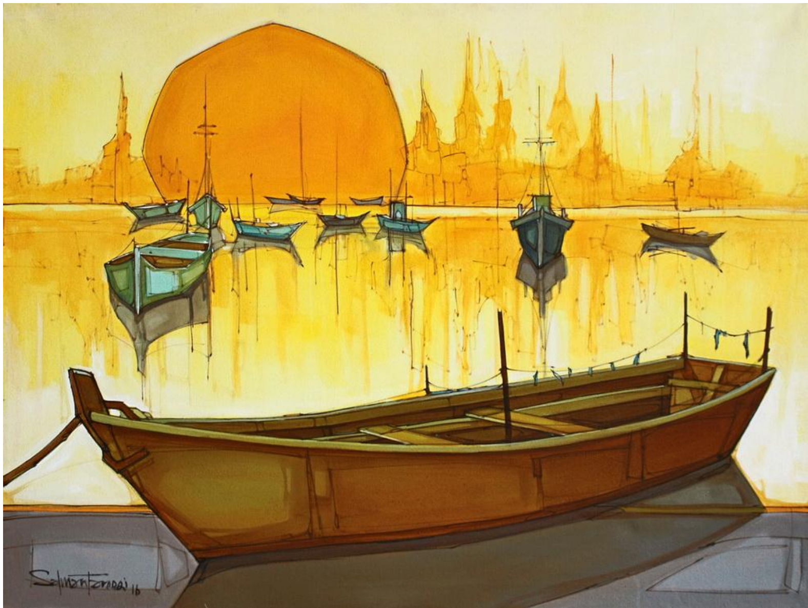
AC-SF-036, Acrylic on Canvas, 36 x 48 Inch, Rs. 125,000