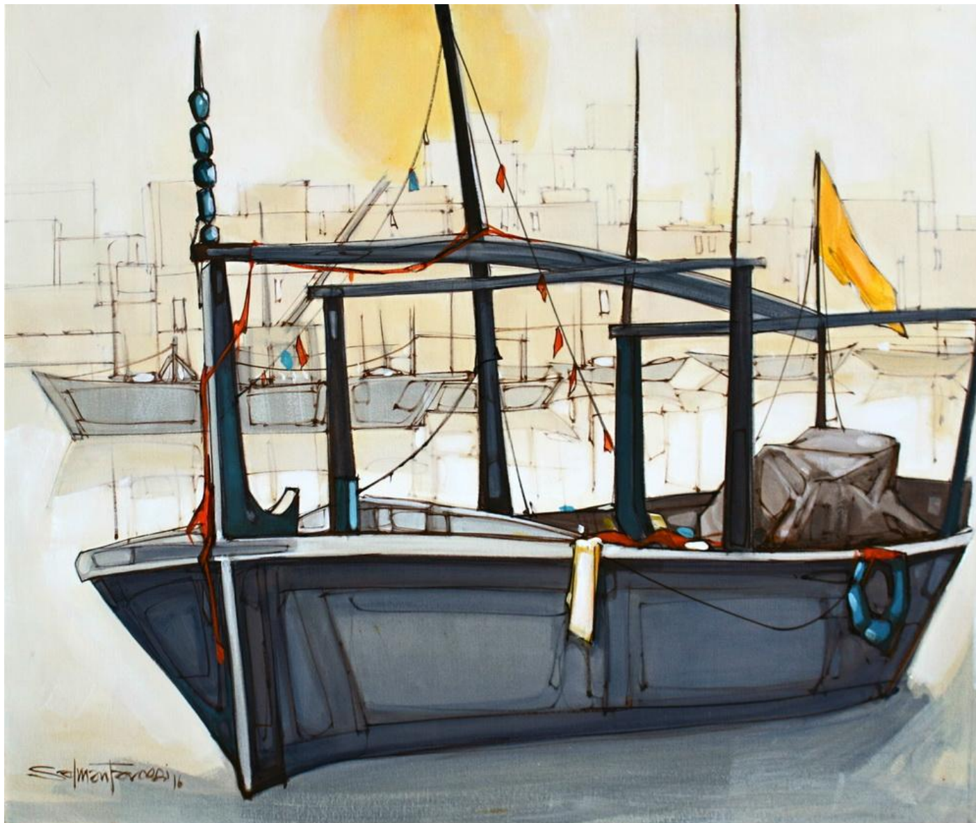
AC-SF-043, Acrylic on Canvas, 30 x 36 Inch, Rs. 80,000