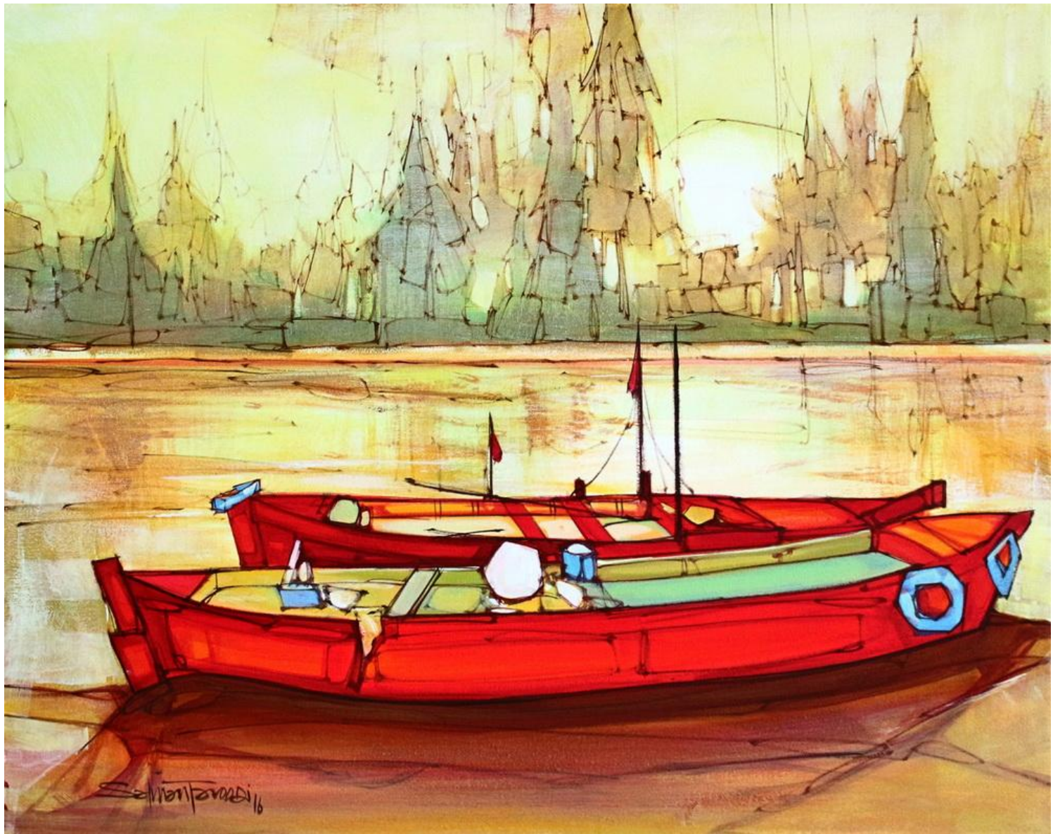
AC-SF-044, Acrylic on Canvas, 24 x 30 Inch, Rs. 65,000