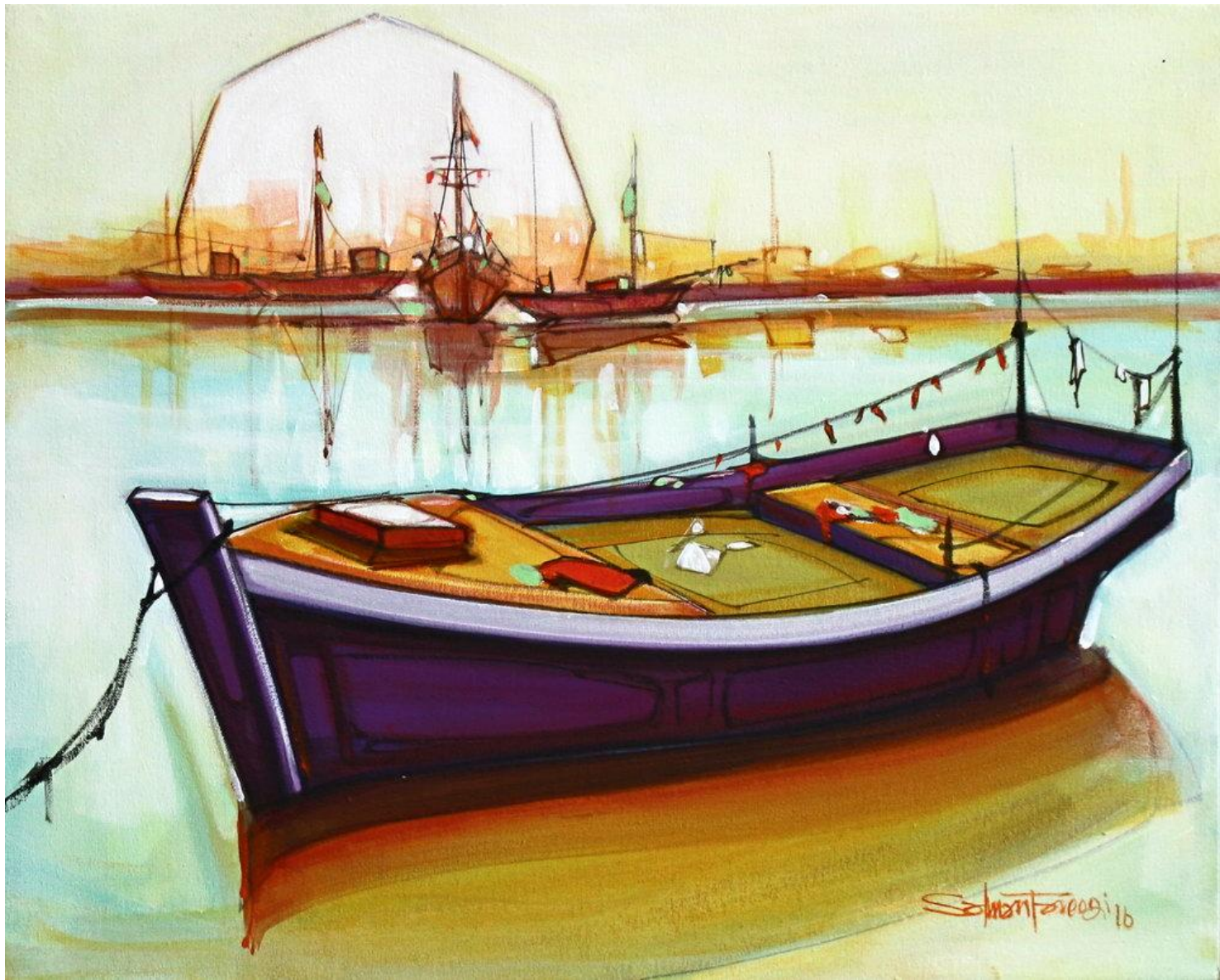
AC-SF-054, Acrylic on Canvas, 16 x 20 Inch, Rs. 50,000