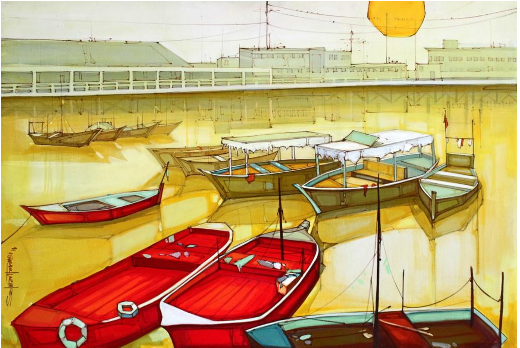
AC-SF-033, Acrylic on Canvas, 36 x 54 Inch, Rs. 175,000