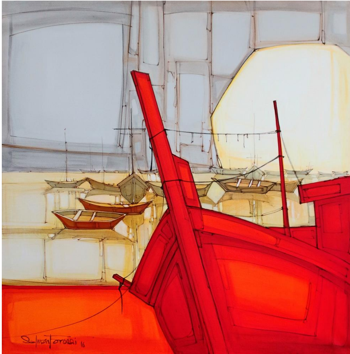
AC-SF-034, Acrylic on Canvas, 48 x 48 Inch, Rs. 165,000