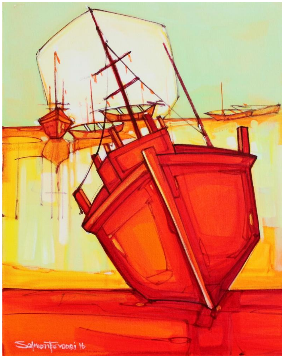
AC-SF-051, Acrylic on Canvas, 16 x 20 Inch, Rs. 50,000