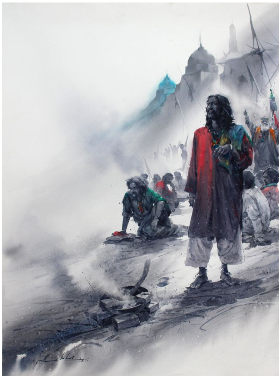
Respite for Repast

Watercolour on Paper | 22x30 Inches | Rs.150,000