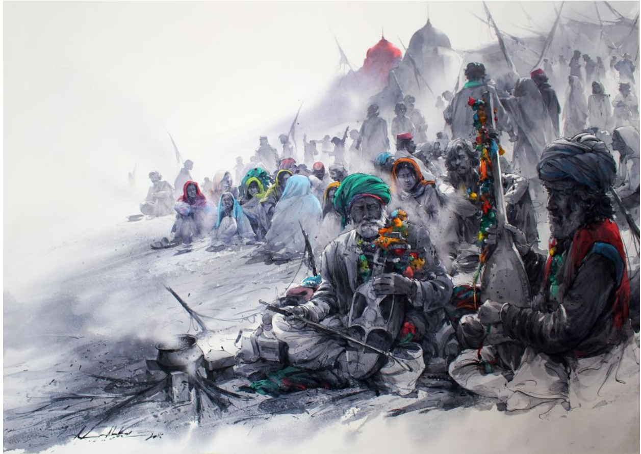
The Saroz Session

Watercolour on Paper | 26x35 Inches | Rs. 275,000