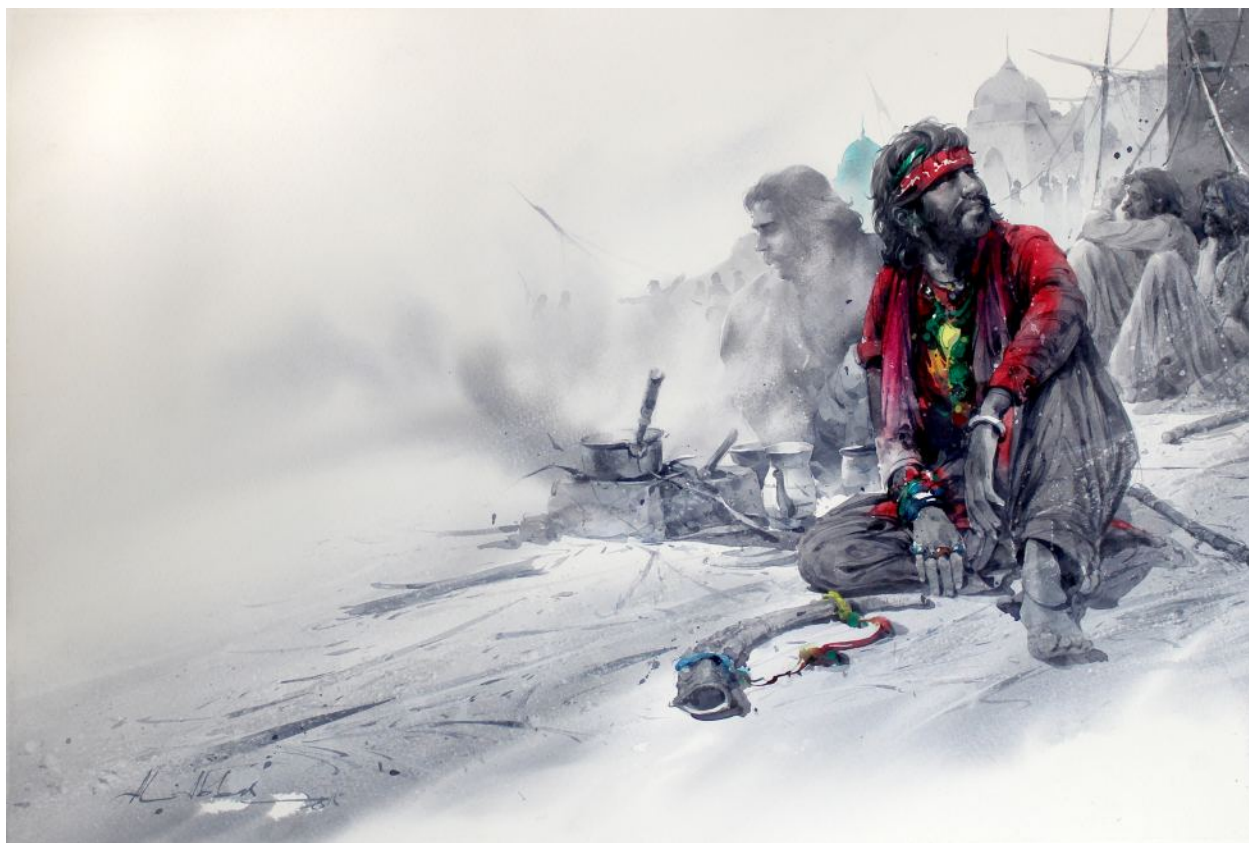
Nostalgic Spiritual Aroma

Watercolour on Paper | 17x25 Inches | Rs.95,000