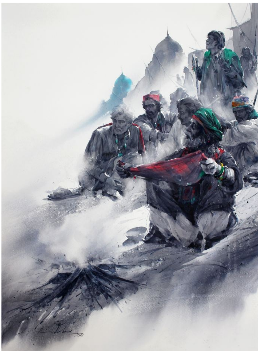
Blessings of the Divine

Watercolour on Paper | 22x30 Inches | Rs.150,000