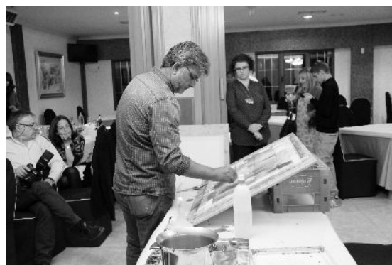
Live Show, Spain