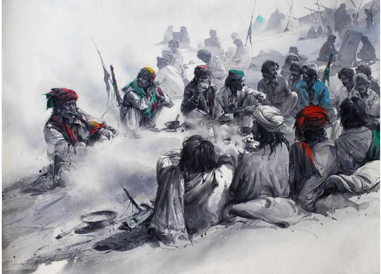
Qehwa Session with Music

Watercolour on Paper | 26x35 Inches | Rs. 275,000