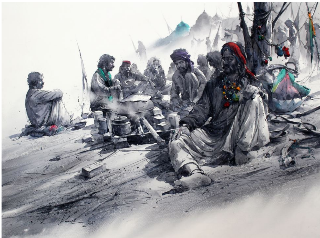
Malang's Roving Kitchen

Watercolour on Paper | 22x30 Inches | Rs.150,000