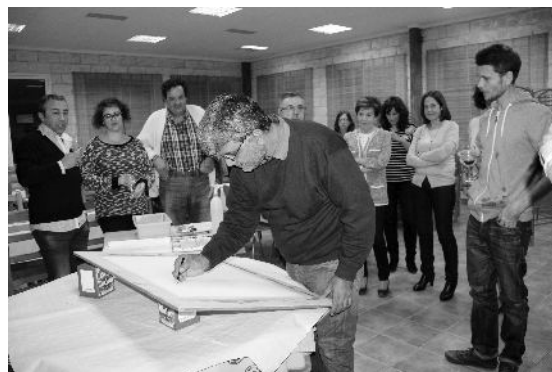
Live Show, Spain