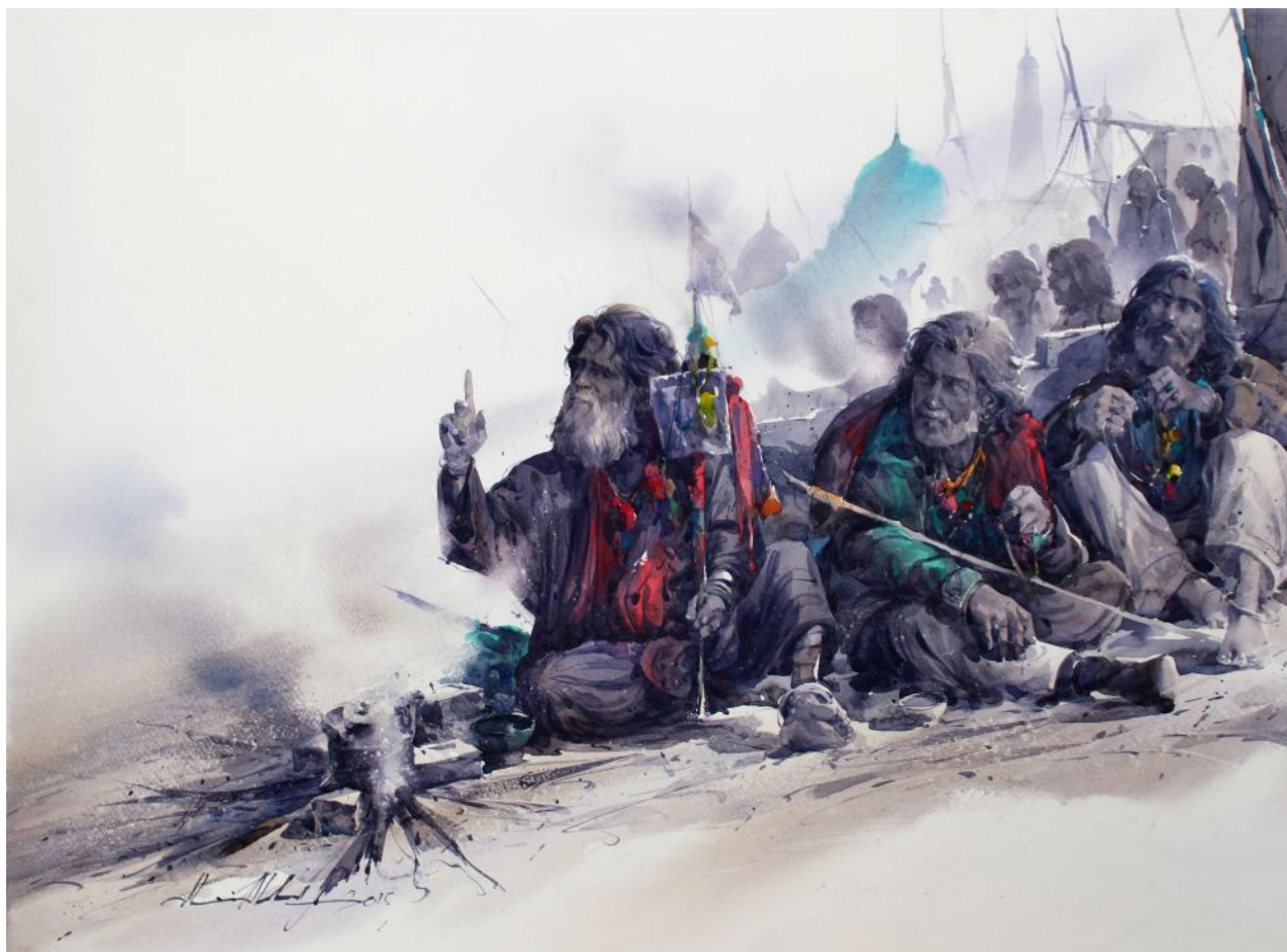
Believe to Achieve

Watercolour on Paper | 22x30 Inches | Rs.150,000