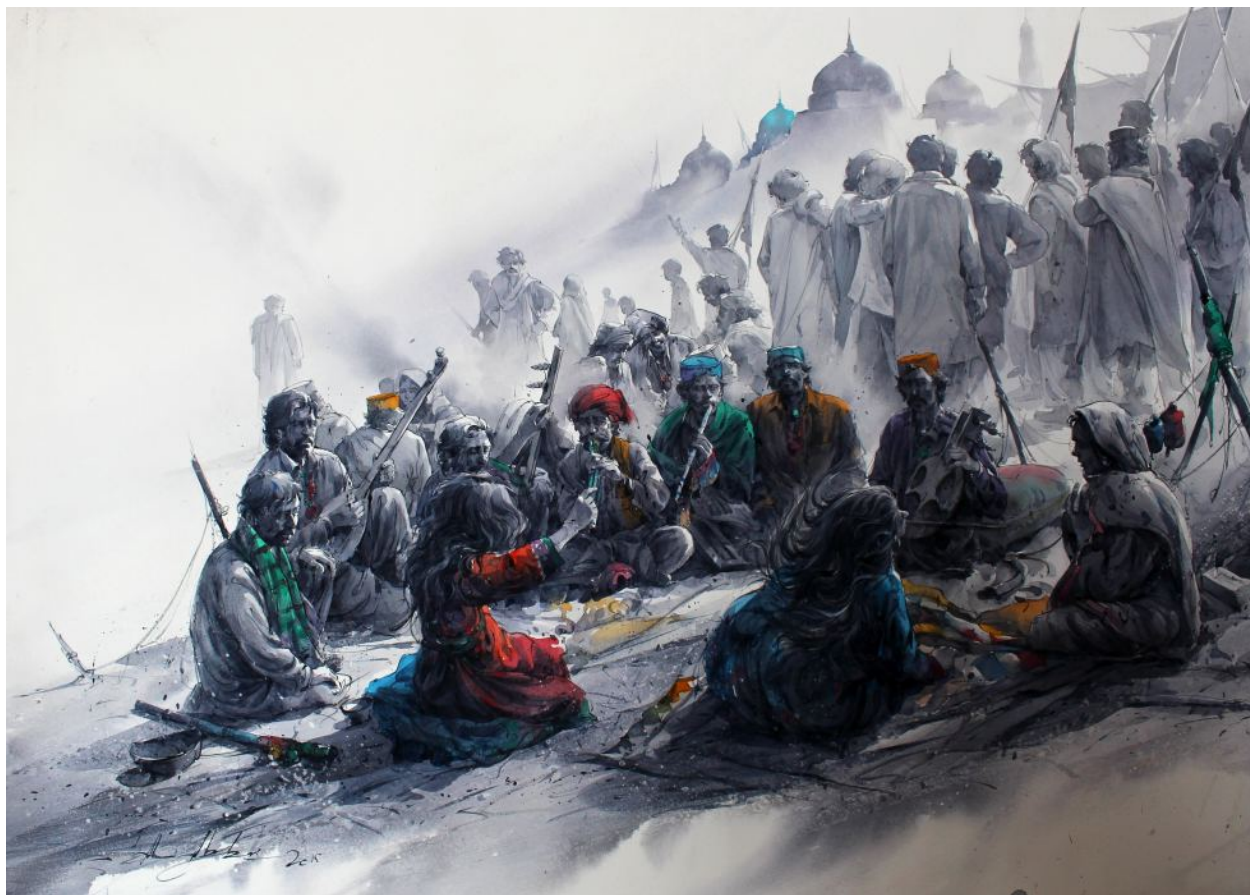
Orchestra of the Nomads

Watercolour on Paper | 26x35 Inches | Rs. 275,000