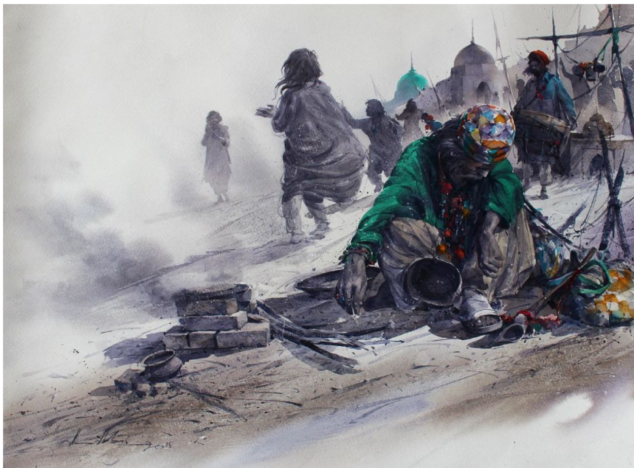
Penitence of the Murshid

Watercolour on Paper | 22x30 Inches | Rs.150,000