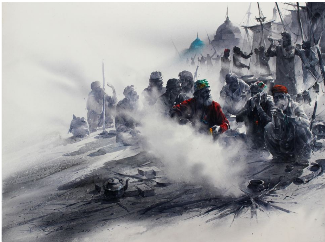
Toking before Meal

Watercolour on Paper | 22x30 Inches | Rs.150,000