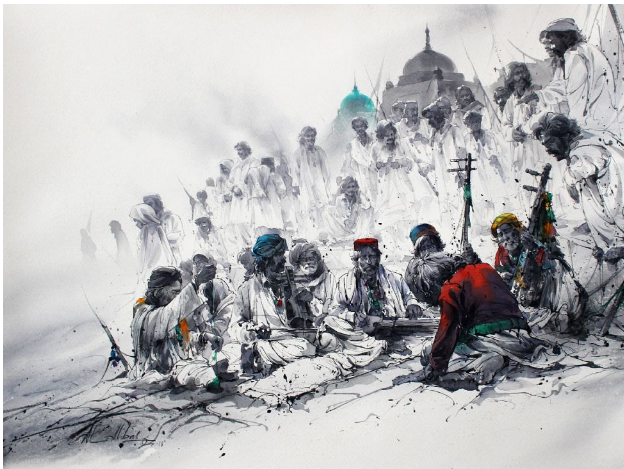
Orchestra of the Jogi

Watercolour on Paper | 22x30 Inches | Rs.150,000