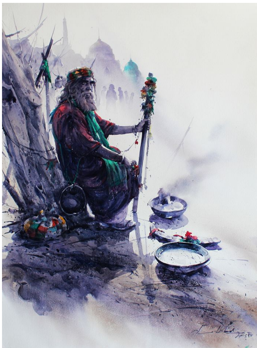
Distant Vision of the Malang

Watercolour on Paper | 22x30 Inches | Rs.150,000