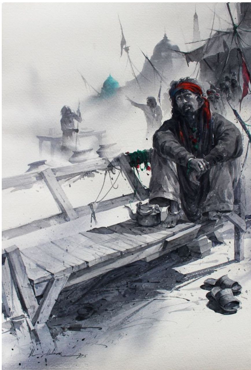
Miracles will Happen

Watercolour on Paper | 15x22 Inches | Rs.95,000